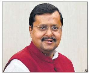
BJP president Nitin Nabin will visit Punjab from June 20 to 22.

As reported by The Tribune first, BJP president Nitin Nabin will visit Punjab from June 20 to 22 and will mark International Yoga Day (June 21) in a border area, most likely Amritsar. The BJP sources also made it clear that the party was strategising to go it alone but added that the pact with the SAD was not something "out of the question". "The fact is in politics there